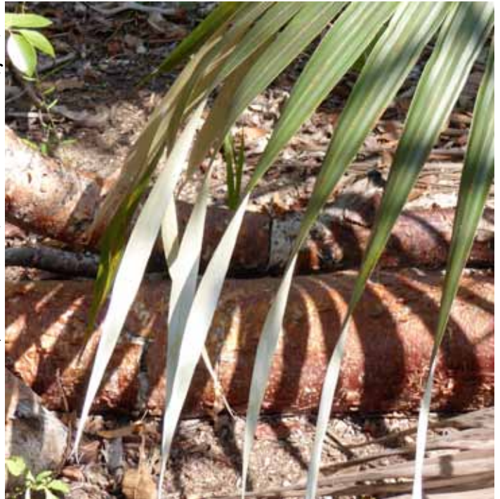
The Silver Thatch Palm (from the WIC Collection)

The most famous use of the Silver Thatch Palm is in the production of rope. The Silver Thatch Palm Tree is highly resistant to salt and rope, made out of the centre shoots of the trees, resists the rotting effects of salt water longer than other types of rope. Silver Thatch Rope was therefore much in demand for use on ships, particularly amongst the fishermen of Jamaica. The leaves were traditionally picked at full moon in the belief that the trees held less sap and that the shoots would produce a stronger rope.