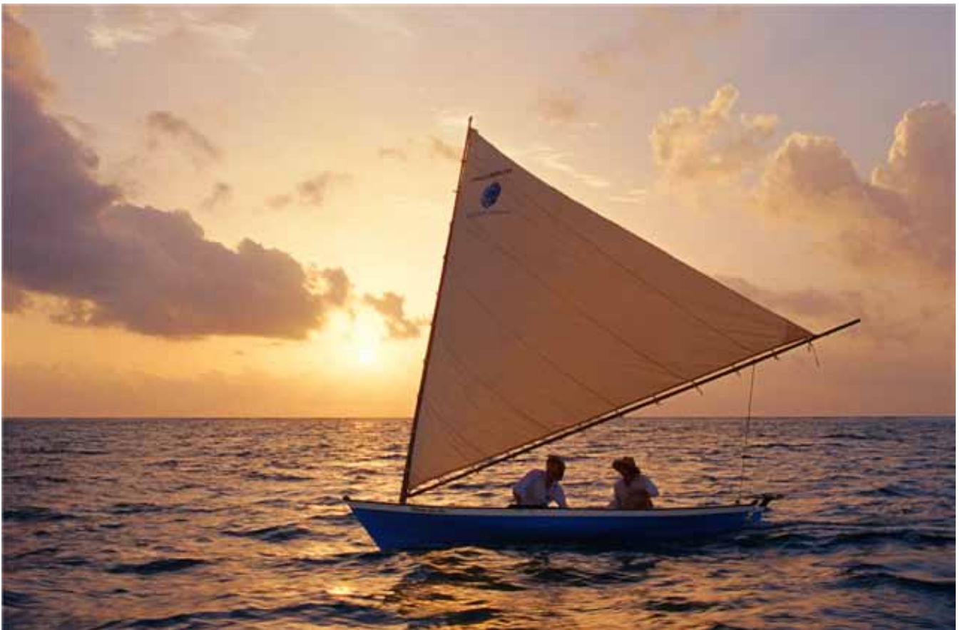
A Caymanian Catboat in full sail