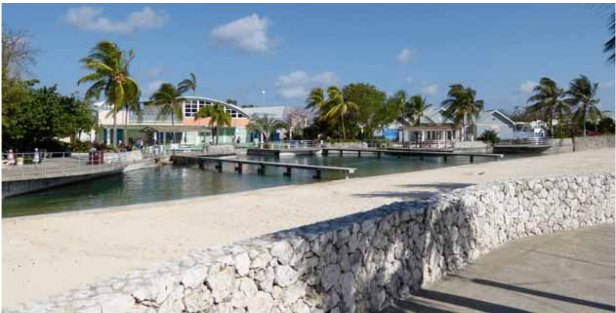
The Turtle Centre