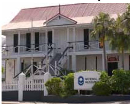
The original Caymanian Post Office is now the National Museum