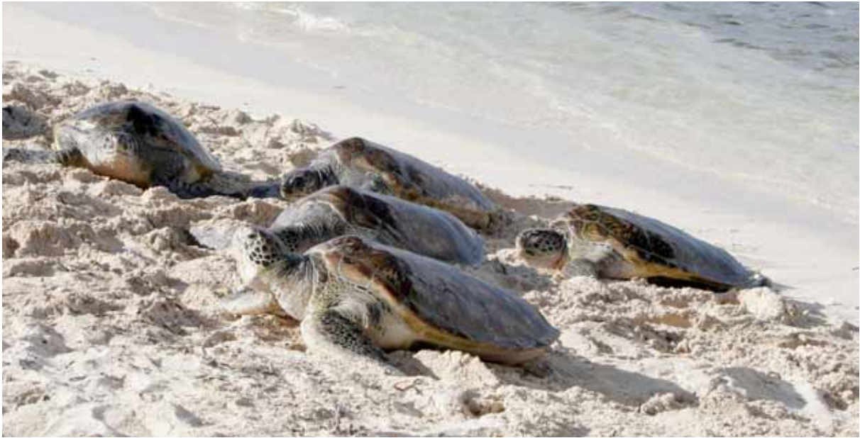
Green turtles nesting on a beach