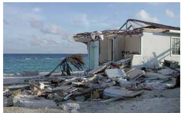
Damage in the aftermath of Hurricane Ivan