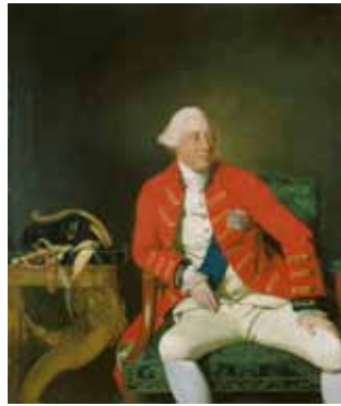
King George III of Great Britain and Ireland