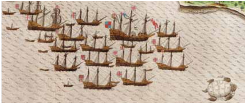
A picture of the fleet that Sir Francis Drake took to the Caribbean

1670 The Treaty of Madrid recognises the Cayman Islands as English