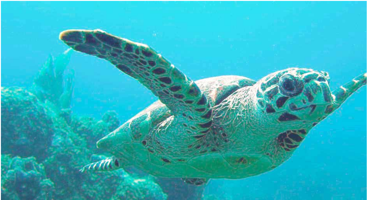
The Hawksbill turtle