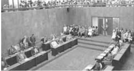
The Legislative Assembly

The Marquess of Sligo visits the Cayman Islands to announce the end of apprenticeship