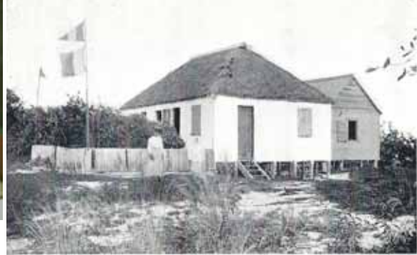
A traditional Caymanian cottage