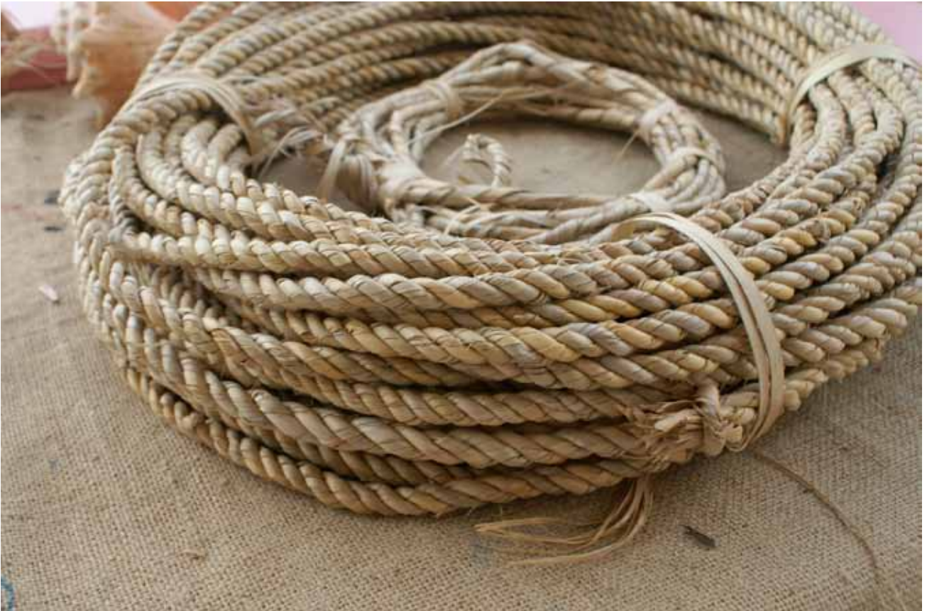
A Coil of Thatch Rope